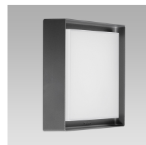
full-rim | opal