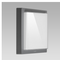
rimless | glossy