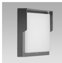
half-rim | opal