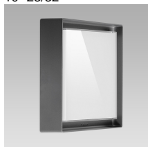
full-rim | glossy