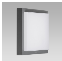
rimless | opal