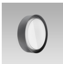
full-rim | glossy