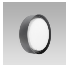
full-rim | opal