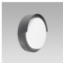
half-rim | opal