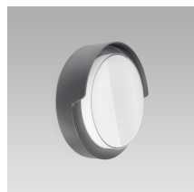
half-rim | glossy