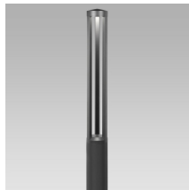
soul180 urban smart