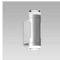
twoway - opal