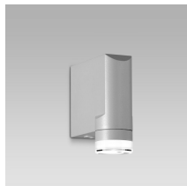
oneway - opal