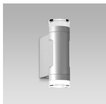
tway - opal