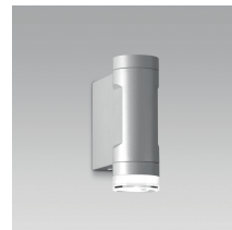
twoway - opal + blade